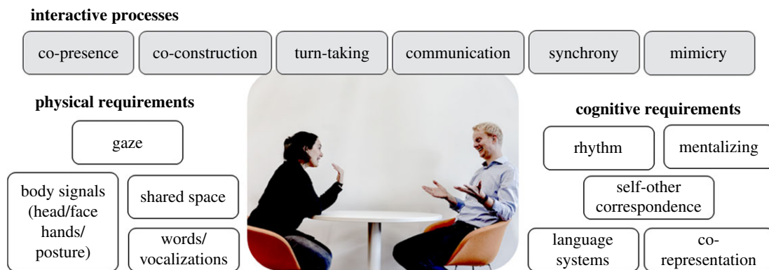
Figure 1. Building blocks of face-to-face interaction. Here we give examples of some interactive processes which cannot be fully studied in solitary individuals; this is not an exhaustive list but summarizes the processes examined in this special issue. For these processes to work, there are particular physical requirements in terms of shared spaces and the use of particular effectors; there are also particular cognitive requirements—processes that have been studied individually but which make a particular contribution or may be engaged differently in interaction.

interact as well as a shared physical (or virtual) space. Delineating the physical requirements of interactions may help us categorize and understand them. Interactive processes also have particular cognitive requirements—there may be basic types of cognition which are essential to interaction, and the figure shows some possible examples. Again, delineating which processes contribute to which interactions will be important in understanding if and how interaction builds on simpler cognitive systems.